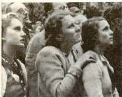
Inspiration to youth.