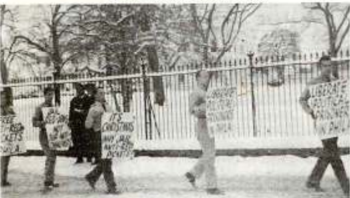
AMNESTY PICKETING IN bitter cold, at White House