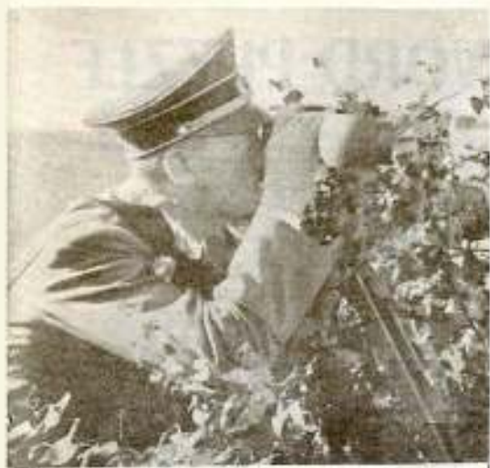
Man of courage, on the front.