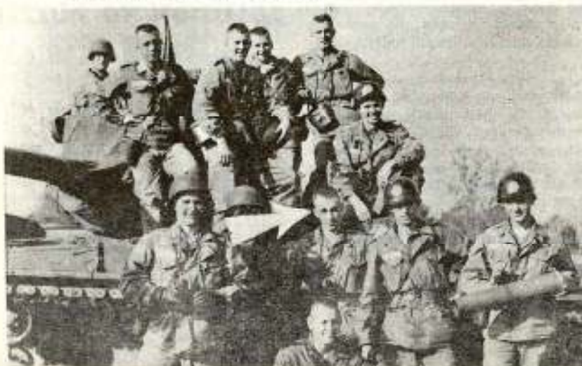
The author at Officer's Candidate School, Ft. Benning, Ga.

My decision to join the Party is reinforced daily. I didn't really BECOME a Nazi, I was BORN ONE--and have decided, now, to live as one.