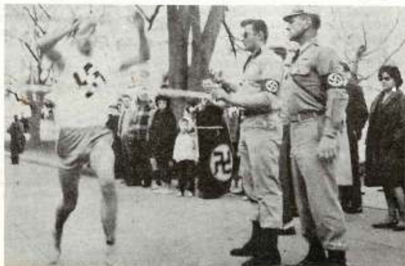
Driving finish!!! Cheers ring out. The Jews stand silent, defeated.