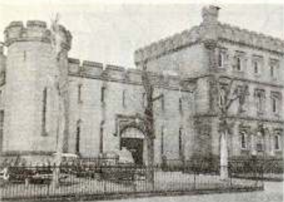
THE STONE WALLS -- which cruelly confine five courageous heroes, Moya- mensing Prison.

in the meantime, was seen darting out a rear door--in his shirt sleeves --too afraid to face the Nazis.