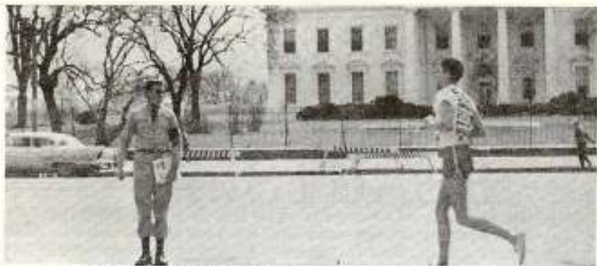
Grinding out the miles, as Trooper guards against Jew attacks.