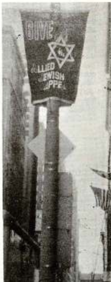
THEIR ALLEGIANCE -- Jew flag flies high on every corner in downtown Phila. Gentiles dare not protest.