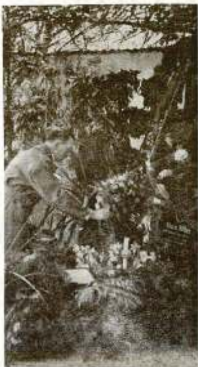
A man of kind and tender consideration.