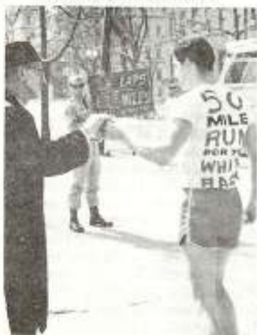
Grabbing a quick drink of water, on the run.