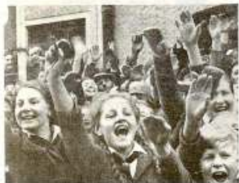
Loved by his people.